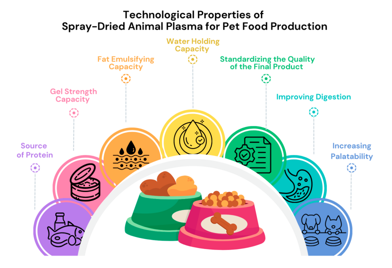
Figure 2. Spray-dried animal plasma in pet food manufacturing: technological and nutritional properties based on [3,17–19,21].

SDAP is available from different sources, including those of porcine, bovine, ovine, and avian origin, and is well recognized by the pet food industry and has applications in both wet and dry pet foods, as well as in semi-moist snacks and treats. It is used as a source of protein and has excellent gel formation and emulsifying properties, as well as a very good water-binding capacity (Figure 2) [3,16–19]. Traditionally, the pet food industry uses SDAP to improve the functional properties of wet pet food meat emulsions. According to the general opinion of pet food manufacturers, SDAP is a unique ingredient in wet formulas because it helps to standardize the quality of the final product by efficiently absorbing quality variance between batches of raw materials [18]. Due to its high (70–80%) protein content, SDAP is used to increase protein levels in raw pet food materials. Cat food containing SDAP has been shown to improve digestion [20]. In addition to their high protein content, blood products in general are also a good source of minerals and trace elements, especially iron. SDAP contains a significant amount of elements expressed as crude ash. Due to its remarkable digestibility and solubility, elements found in SDAP are highly accessible to animals. The inclusion of SDAP in a wet cat food formulation results in notable improvements in the apparent digestibility of crude ash, calcium, and phosphorus [20].